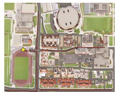
Parking 7 Level 2

*Please reference the device number locations below.