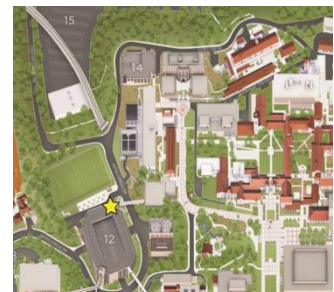
Parking 12 Level 1