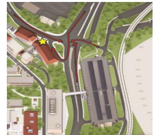
Chemical Science Lab