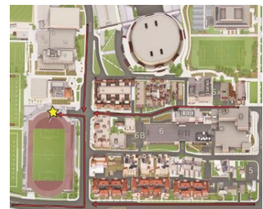
Parking 7 Level 2

*Please reference the device number locations below.