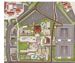
Parking 3 Level 1