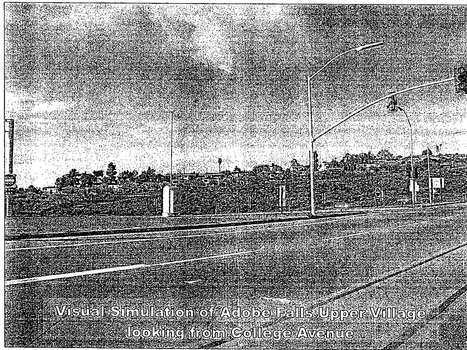
Visual Simulation of Adobe Falls Upper Village looking from College Avenue

NOTE: Visual Simulations are conceptual in nature as detailed architectural plans have yet to be prepared.